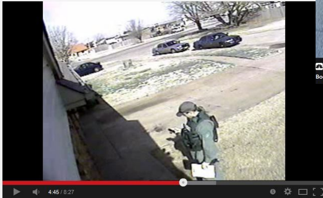
American Citizens: You Have NO Rights Left! Oklahoma Jackb...