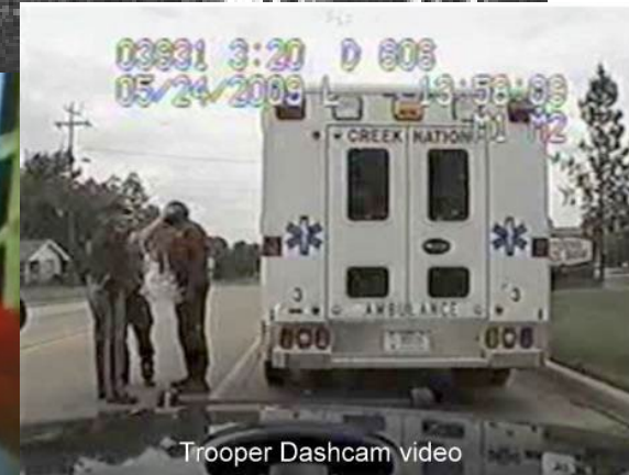
Trooper Dashcam video