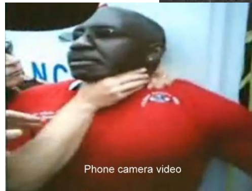
Phone camera video